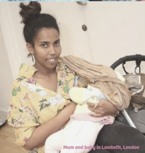
Mum and baby in Lambeth, London