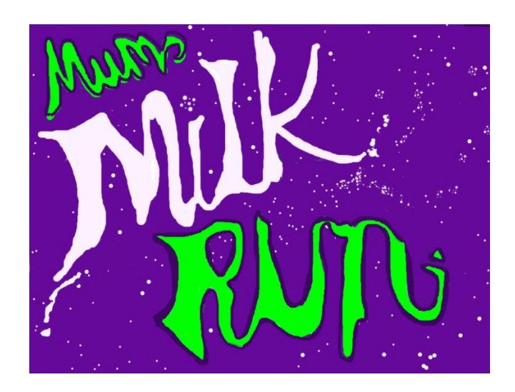
It's the 2014 Mums' Milk Run 14<sup>th</sup> June 2014! Join the Party!

The event will be held in various locations across the UK but we need YOU to organise local events in your area.