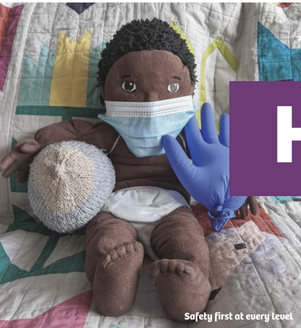
Safety first at every level