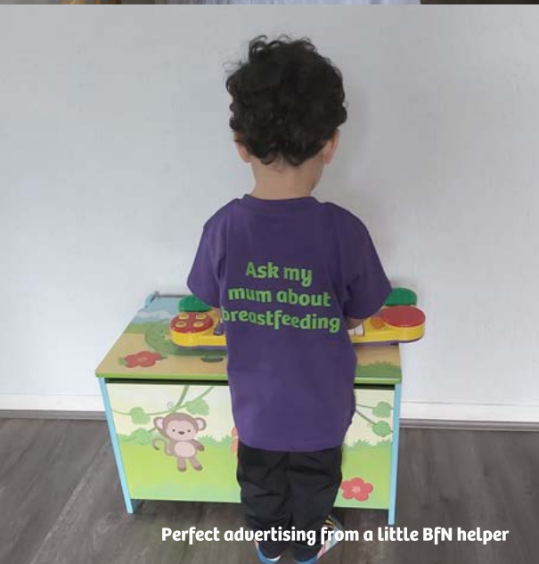
Perfect advertising from a little BfN helper